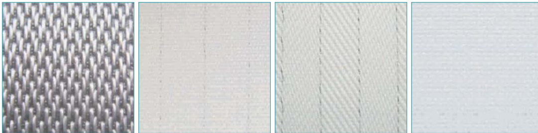
Code: 22 Material: Polyester